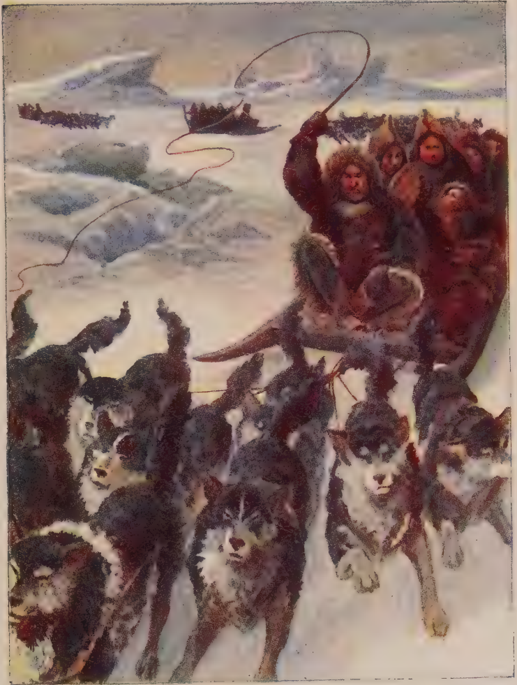
“Several of the sledges were flying at full speed over the frozen sea.”